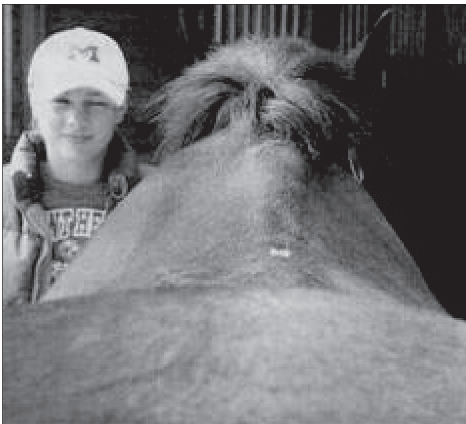
Lower heel side